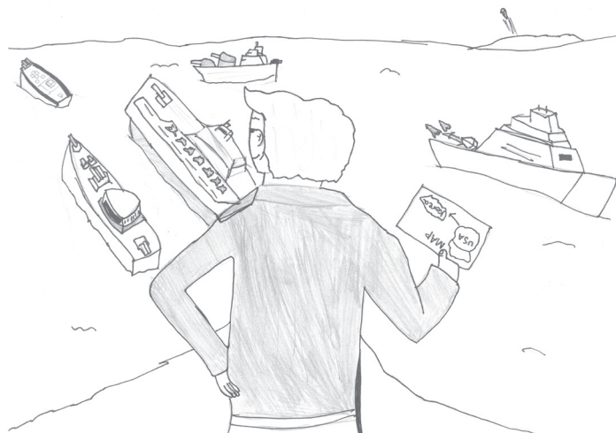
Donald Trump by Thomas Mann