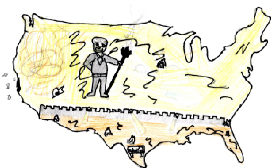
A depiction of "Trump's America" by Thomas Mann