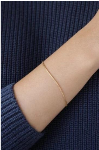
Simple, fine chain