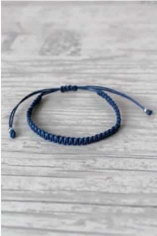
Simple woven band (leather/thread)